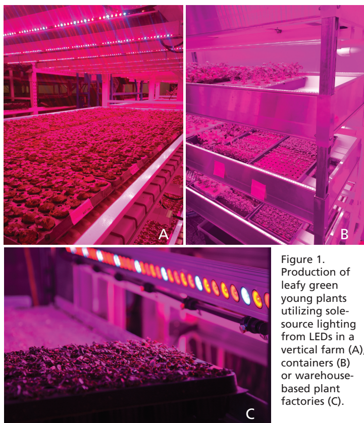
Figure 1. Production of leafy green young plants utilizing sole-source lighting from LEDs in a vertical farm (A), containers (B) or warehouse-based plant factories (C).

Currently, we're investigating not only how light quality and light intensity affect bedding plant seedling production, but also how light interacts with other environmental factors. ►